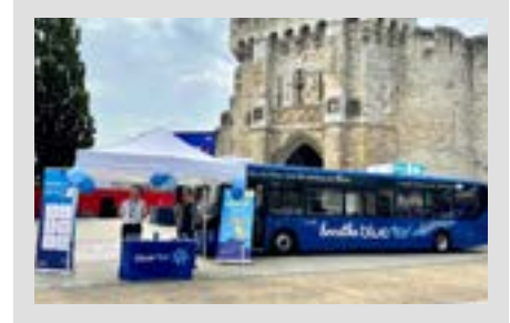
Bluestar Bargate promotional event