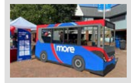
morebus Poole Town Centre promotional event