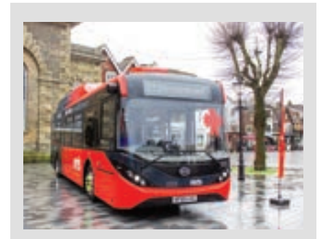
Electric buses Park & Ride Salisbury

Our support for our local communities continued throughout the year, and whilst the current situation dictates how we currently do this, our commitment to the communities we serve will continue going forward.