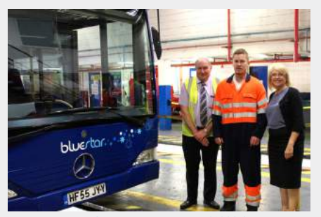
Wilts & Dorset Centenary day raised \pounds 6000 for our charity of the year

Bluestar's charity of the year is The Rainbow Project who is based in Southampton. The charity was founded in 1981 and provides a range of services to support vulnerable and disadvantaged young people. Part of their work is helping to prepare their young people for working life and to help secure employment. The charity mentors and helps their young people progress in their chosen career; this is all done in partnership with local businesses.